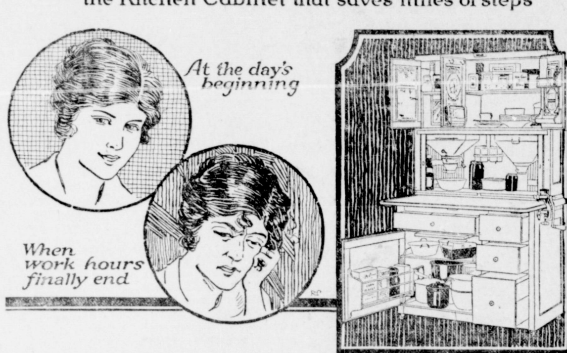
$75.00 Hoosier Kitchen Cabinet on Display at Cisco Furniture

the Kitchen Cabinet that saves miles of steps