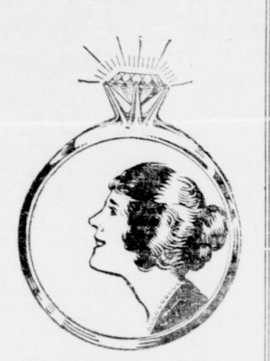
$300 Diamond Ring on Display at Haltom & Mitchell's

TOBE GIVENAWAY To the most REPRESENTATIVE Women of Cisco and Vicinity, as determined by OUR BIG VOTING CONTEST