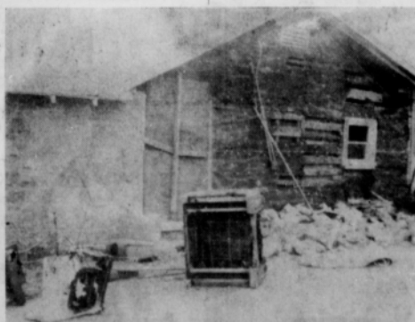
Pictured above is the house that was wrecked early Sunday morning when an accumulation of butane exploded.

Damage to the house included the blowing off of most of the heavy rock veneer, buckled the walls, window glass blown from panes, and fire damaged furnishings and the house. The blast almost demolished the