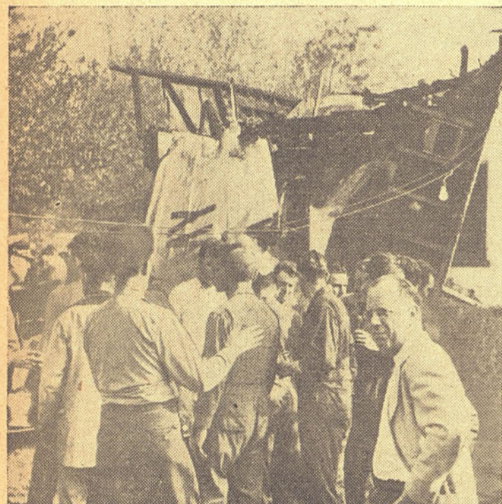
TEST PILOT DIES—Police officers and aircraft workers gather about wreckage of experimental P-38 Lockheed plane which carried test pilot to death as it crashed into two houses when "something went wrong," in power dive at Glendale, Cal.