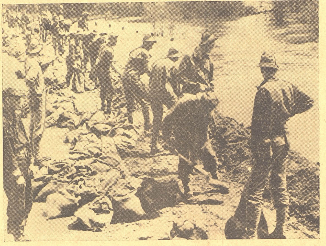
ENGINEERS BATTLE FLOOD-U. S. Army Engineers build levee to stem rising crest of Boise River overflowing bottom lands near Gowen Field, Idaho. More than 150 families were evacuated from their homes. Flood threatened many bridges.

"Please come and get your gineer at the ice plant of the share of thread to make a gar- West Texas Utilities company. He ment or two for some needy boy." was born in Cisco and graduated The Red Cross work room will from Cisco high school in 1942.