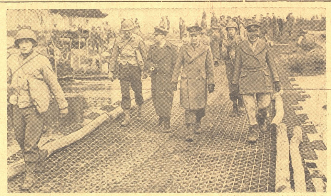
NEW USE FOR MATS-Portable emergency airplans landing mats find a new use as a temporary bridge built over swamp at unnamed Army Air Base. U. S. officers explained technique of these Irving open-mesh gratings to British General.