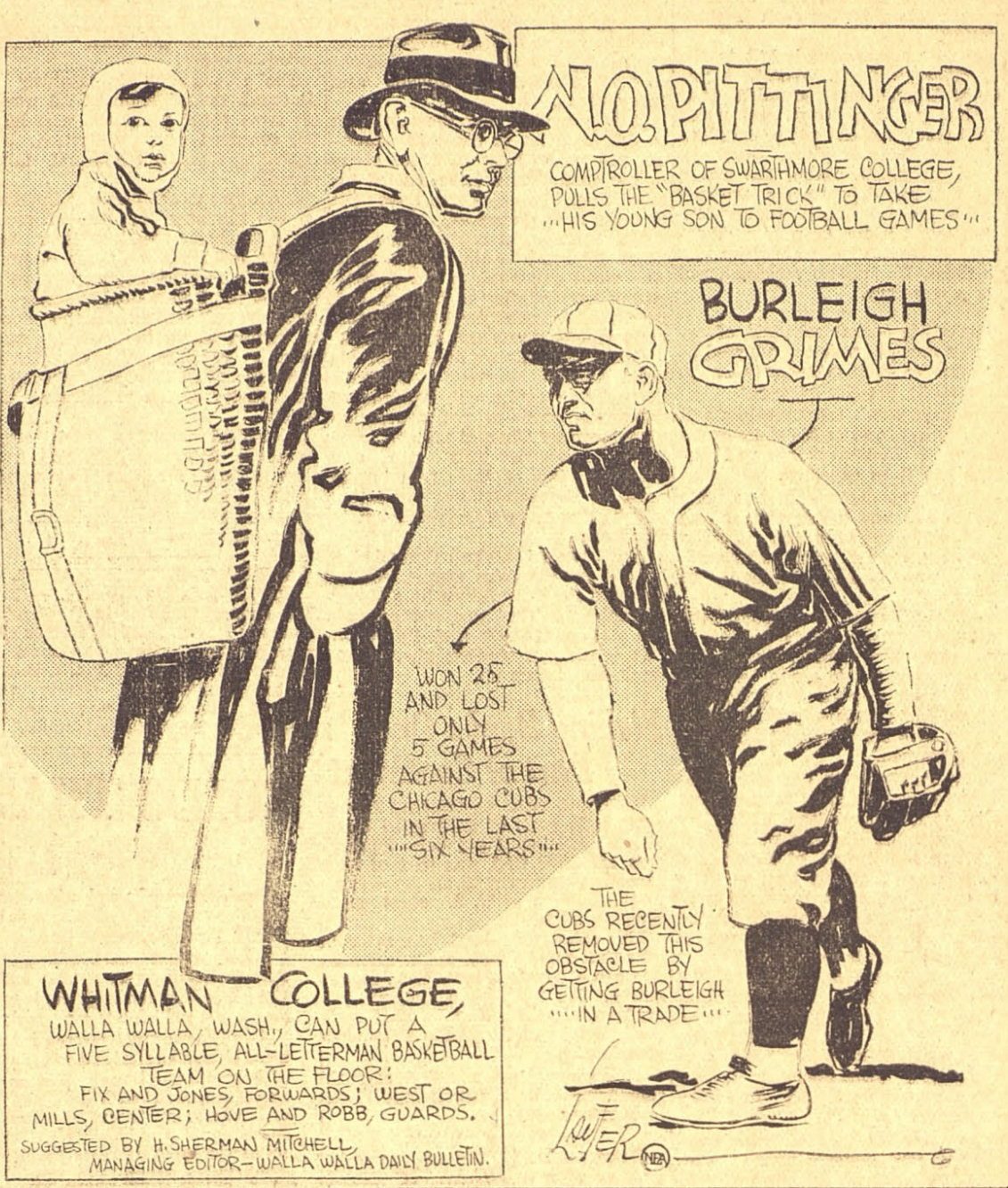
WHITMAN COLLEGE WALLA WALLA, WASH., CAN PUT A FIVE SYLLABLE, ALL-LETTERMAN BASKETBALL TEAM ON THE FLOOR.