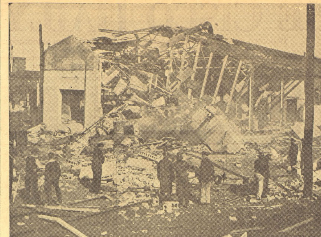
POWDER PLANT BLAST—Officials are investigating blast which demolished this bomb powder building of the National Magnesium Company at Newark, N. J. One man was killed and three others injured. Further damage was prevented as fire failed to follow blast.

How To Relieve Bronchitis. Creomulsion relieves promptly because it goes right to the seat of the trouble to help loosen and expel germ laden phlegm, and aid nature to soothe and heal raw, tender, inflamed bronchial mucous membranes.