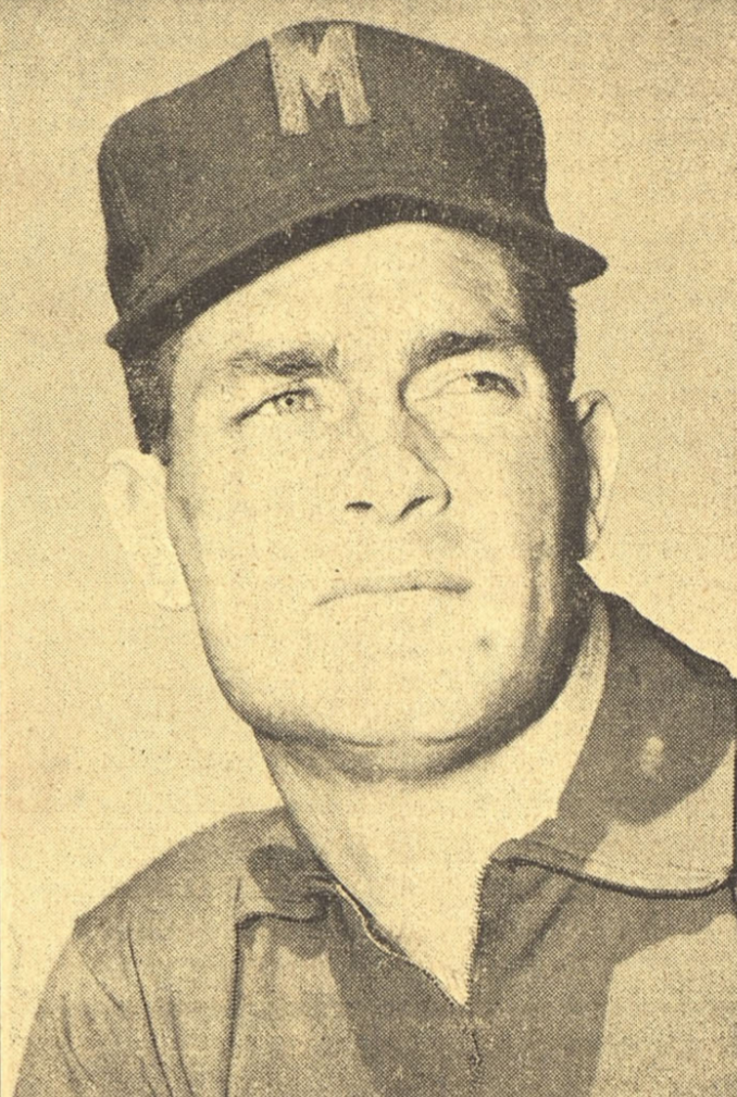
HAYDEN FRY head coach at SMU