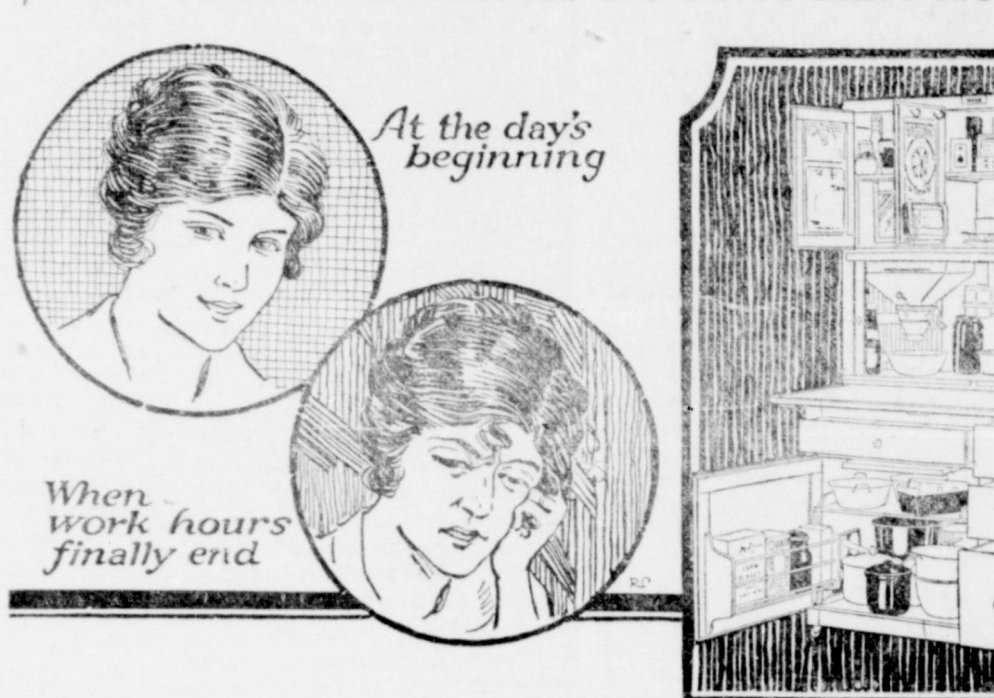
$75.00 Hoosier Kitchen Cabinet on Display at Cisco Furniture Co

- the Kitchen Cabinet that saves miles of steps