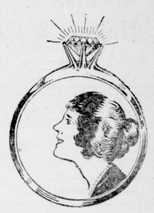
$300 Diamond Ring on Display at Haltom & Mitchell's