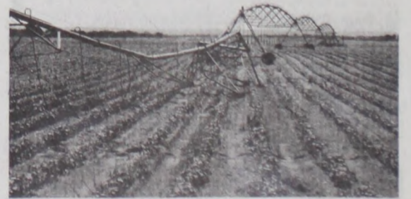
This pivot irrigation system was damaged by high winds last Wednesday night as a storm roared through the Gasoline community. Scattered, locally heavy, rains associated with this storm fell over the area.