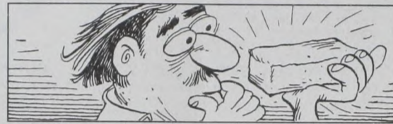
Twenty-four-karat gold contains a small amount of copper.