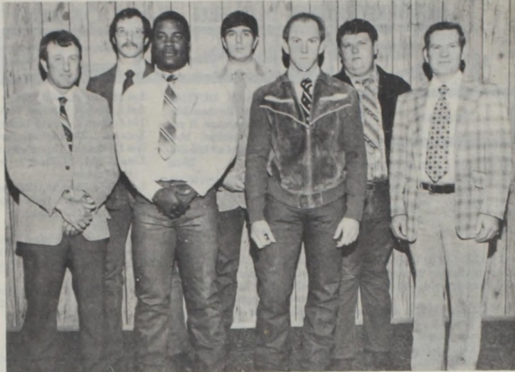
Pictured are members of the Panhandle State University Meat Animal Evaluation Team.