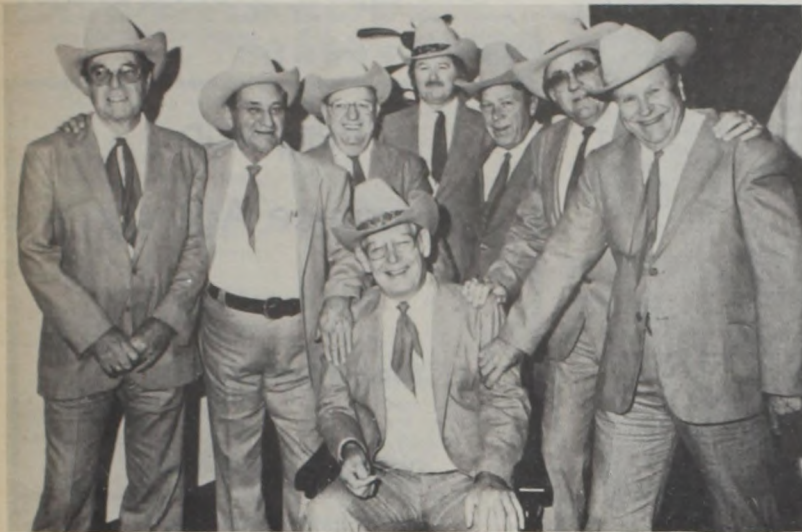
BOB WILLS ORIGINAL TEXAS PLAYBOYS —The annual Bob Wills Day celebration will be held April 29 and 30 in Turkey. Over 25 former Texas Playboy Band members will be on hand

for the two-day event with a dance on Friday night and a parade and concert on Saturday. Many of Wills' western movies will be shown in the museum on Saturday and band members will