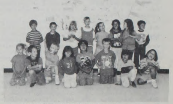
1991-92 VALLEY KINDERGARTEN CLASS

On June 11 from 9-11 and 1-3 p.m. the clinic will be in Childress Texas Department of Helath Office at 201 Commerce.