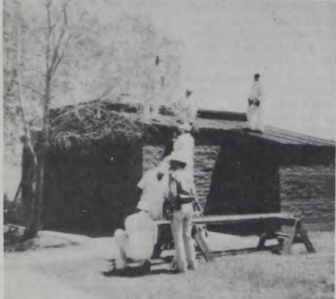
Inmates reroof Caprock Canyons State Park Buildings.

VOLUME 36 NUMBER 48 4 PAGES BRISCOE COUNTY QUITAQUE, TX 79255 THURSDAY, May 15, 1997