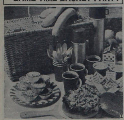
FOOTBALL AND FOOD are equally part of the seasonal celebrations. A picnic with game-time savvy features Bread Bowl salad (foreground), Krispy Crackers spread with cheese, Banana Chiffon Cup Cakes. Jugs of steamy coffee and tea are "musts."