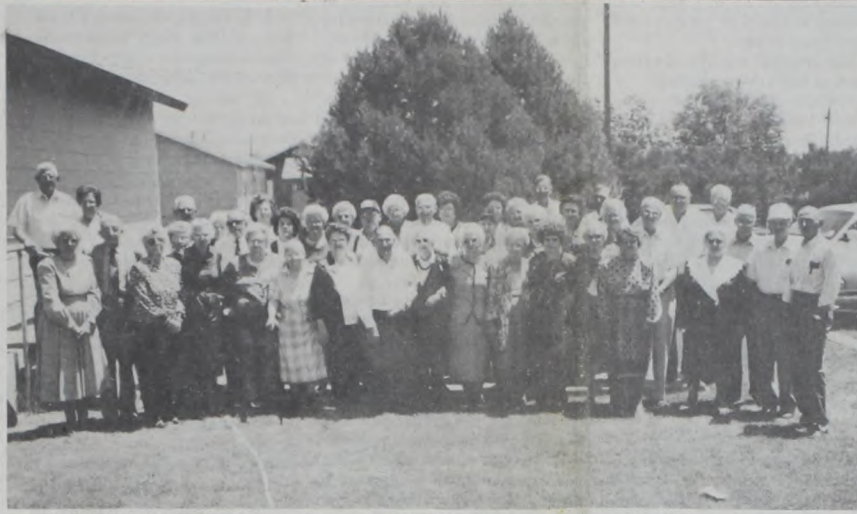
GASOLINE HOMECOMING was held August 7, in the Quitaque Community Center. Approximately 125 persons attended. These folks are all former schoolmates at Gasoline School. See story page 2.

Les Brown once said that no one's opinion of you has to be your reality. Regardless of what someone tells you about yourself, either good or bad, you do not have to accept it as your truth. You and only you have the power to change your reality to what you want it to be. If you want to be an A student--put out the effort and chances are you will have those A's on your report card. If you want to take a chance on a new job--follow your heart and give it all you have and you probably will not only get the new job but you will find that it is the kind of job that you thought it was, one that you look forward to attacking each day. If you wish your life was different, no one's opinion counts, just yours--think your ideas through and then follow through to the conclusion. The reward is your happiness! After all that is what is at stake in any situation, Your Happiness!