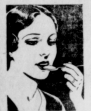
Let your TASTE be the JUDGE

earthy taste in Rexall Milk of Magnesia. Your first glimpse of its whiteness tells you it excels in purity. This extra purity accounts for the speedy acid neutralazing power. Indigestion, heartburn, sour stomach disappear in a few minhtes after you take a dose of Rexall Milk of Magnesia.