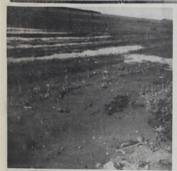
BEDRAGGLED COTTON ON THE RALPH CARTER FARM AFTER SUNDAY NIGHT'S STORM