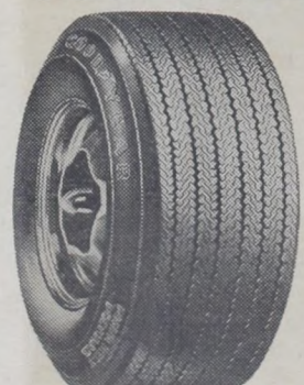
SALE ENDS SAT. NIGHT!

• Why buy unknown brands when you can get Goodyear Power Belt Poylglas at these prices • Two fiberglass belts...today's most preferred tire body cord. You get 4 plies under the tread for strength – that's the Goodyear Power Belt Polyglas tire.