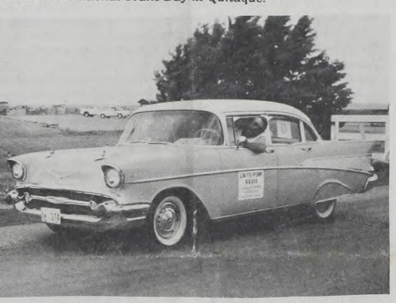
Leon Lavy of Silverton 1950's Chevrolet driven by Clyde Dudley of Quitaque came in first in the Classic Car Division of the 1997 Trails Day Parade.