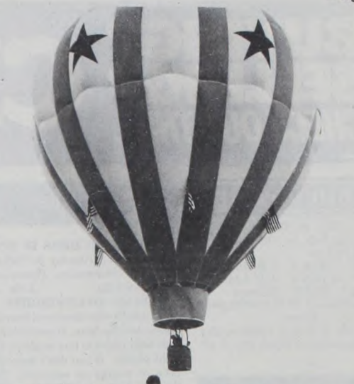
Patriotic balloon rises over Trail Head on National Trails Day in Quitaque, June 7, 1997