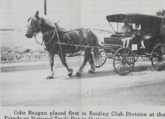
Odis Reagan placed first in Raiding Club Division at the Parade on National Trails Day in Quitaque.

835-5322). The FCC toll-free numbers use the new 1-888 toll-free number sequence, not the older 800 toll-free service.