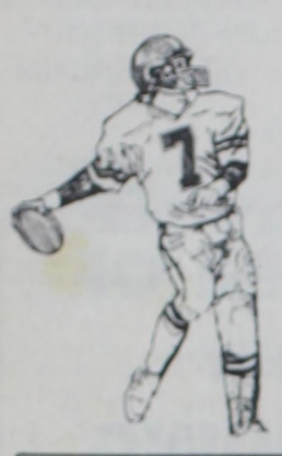
1988 VALLEY HIGH SCHOOL