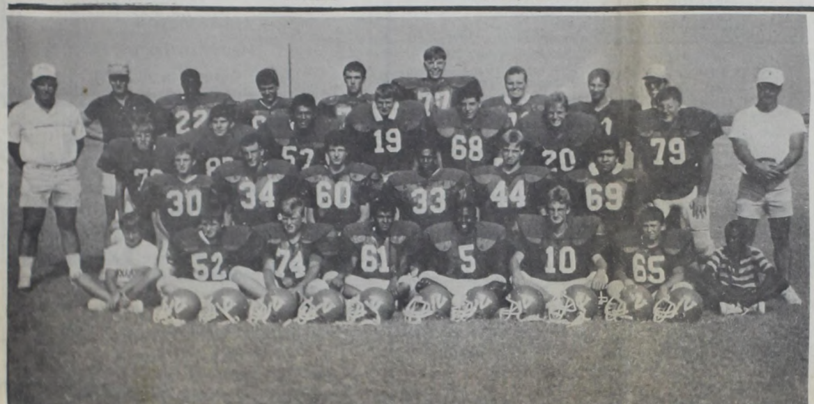
THE VALLEY PATRIOTS are to open the season against the Claude Mustangs. They won the scrimmage with Nazareth, looking forward to an exciting season.