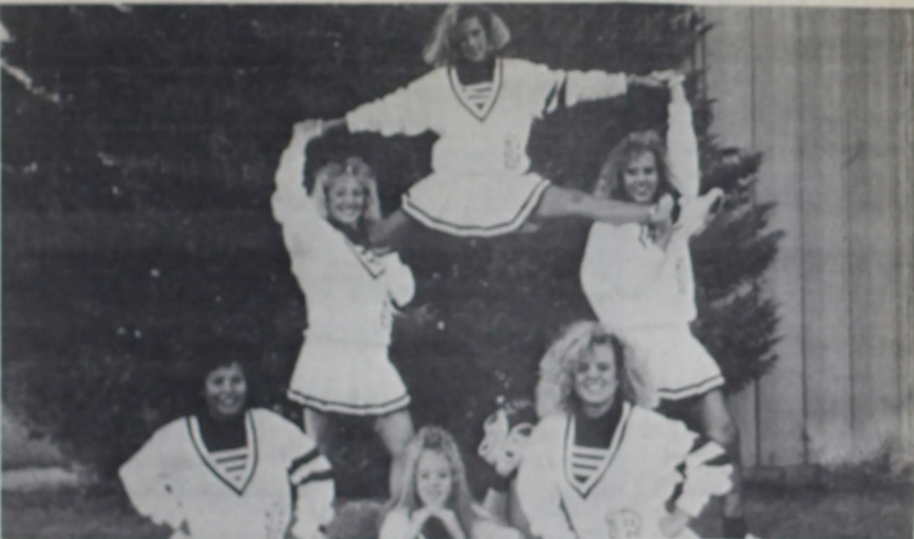
1988 PATRIOT CHEERLEADERS