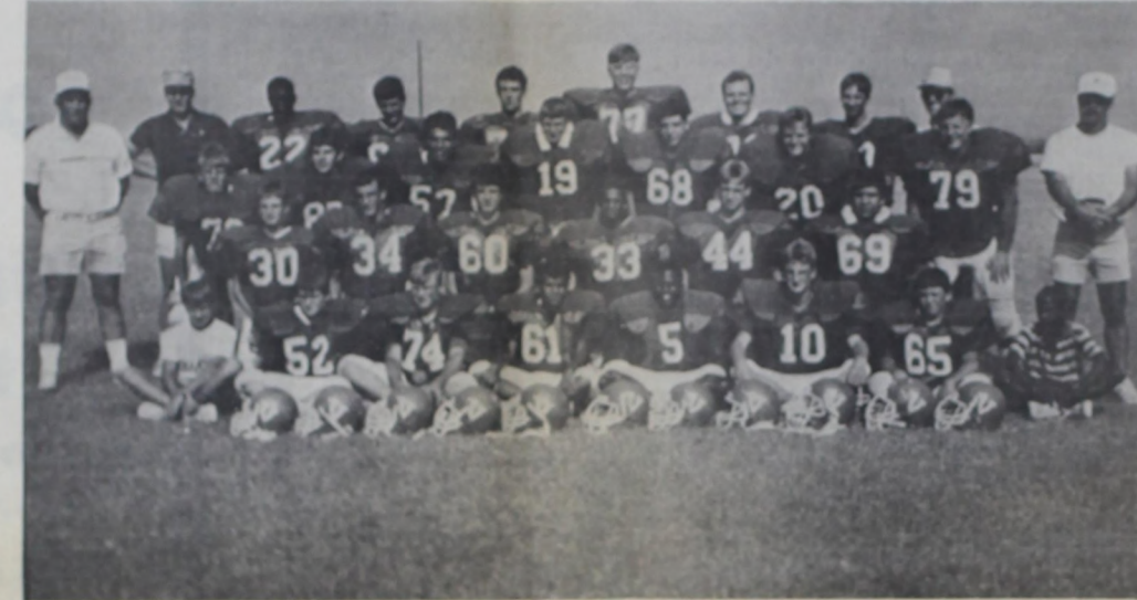
1988 Valley Patriots