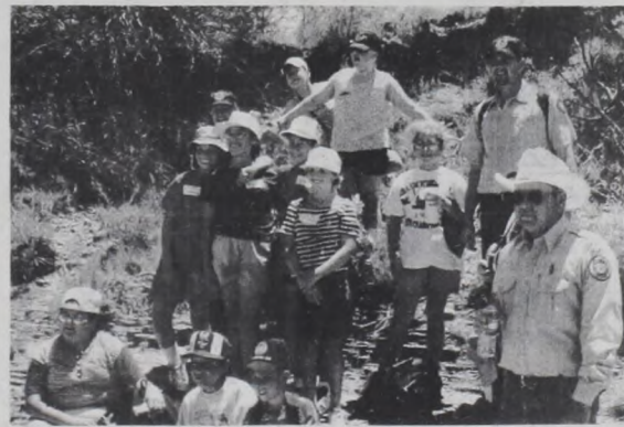
Last summer, Valley School 5th graders enjoyed hiking in South Prong as one of the many activities they participated in during the caprock Campers program.