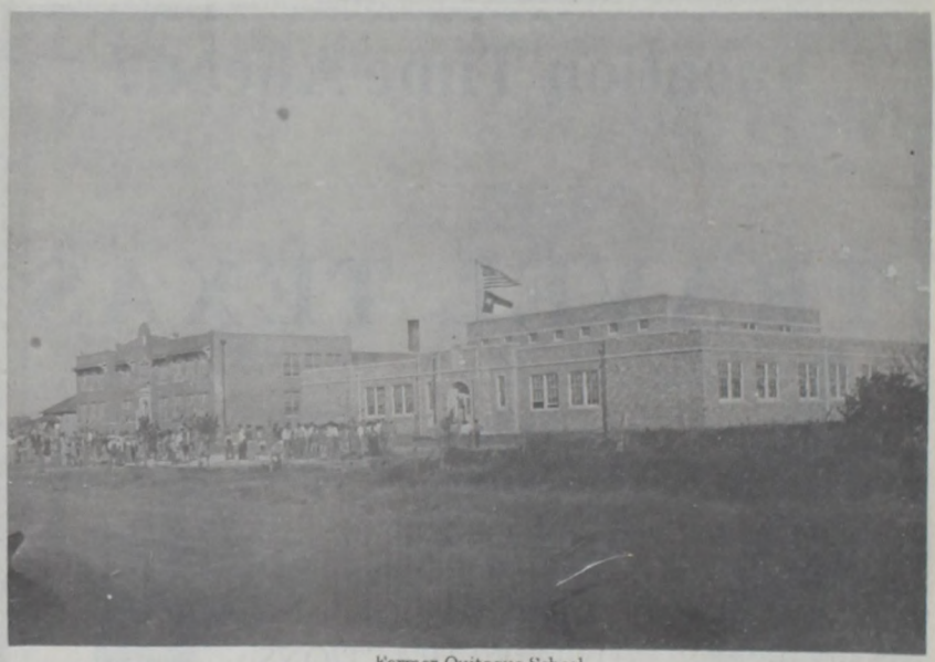
Former Quitaque School