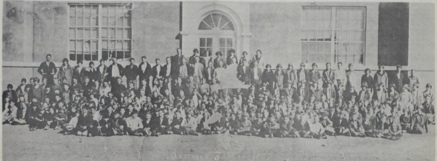
Faculty and Student Body of Quitaque School, 1925

VOLUME 30 NUMBER 09 6 PAGES BRISCOE, COUNTY QUITAQUE, TX 79255 THURSDAY, AUGUST 2, 1990