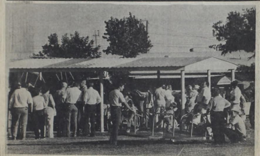
Homecoming Festivities at the City Park.