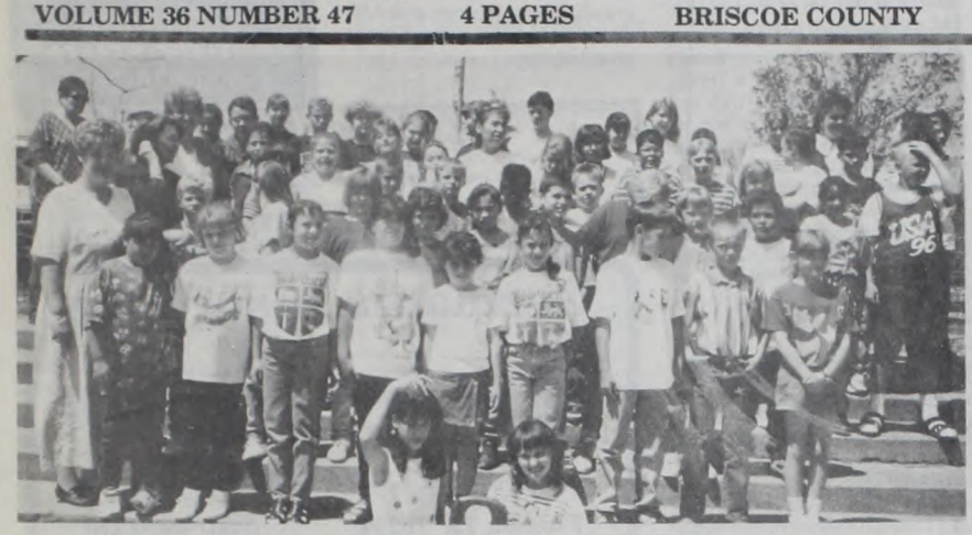
Valley Elementary UIL Students and Coaches from Valley School.