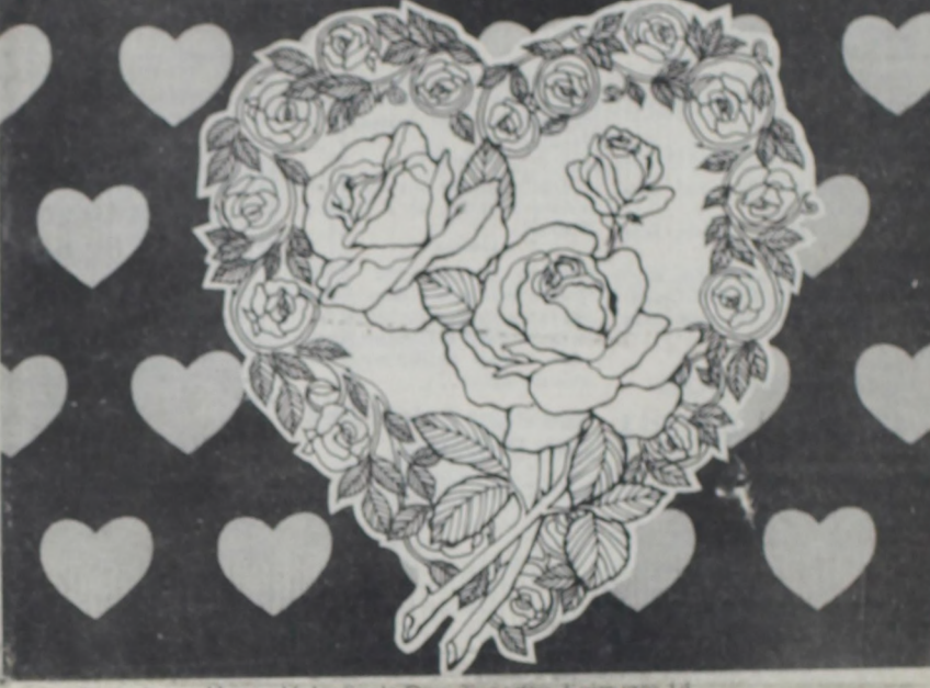
Happy Valentine's Day, Tuesday, February 14

Thursday Camera Club Turkey City Council Monday We The Women Quitaque Fire Department Valley Board of Trustees Tuesday Turkey Lions Club Turkey Senior Citizens Chamber of Commerce