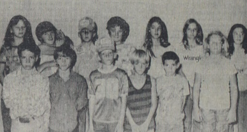
CHILDREN WHO ATTENDED THE FARMERS UNION PLAY DAY