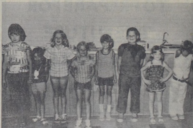
CHILDREN WHO ATTENDED THE FARMERS UNION PLAY DAY