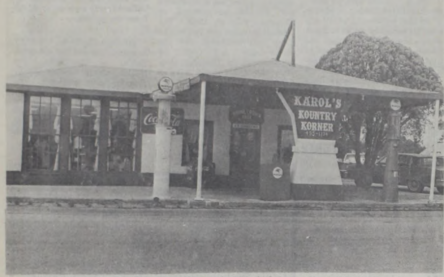
Third generation to operate business in same building in Quitaque, Karol's Kountry Korner