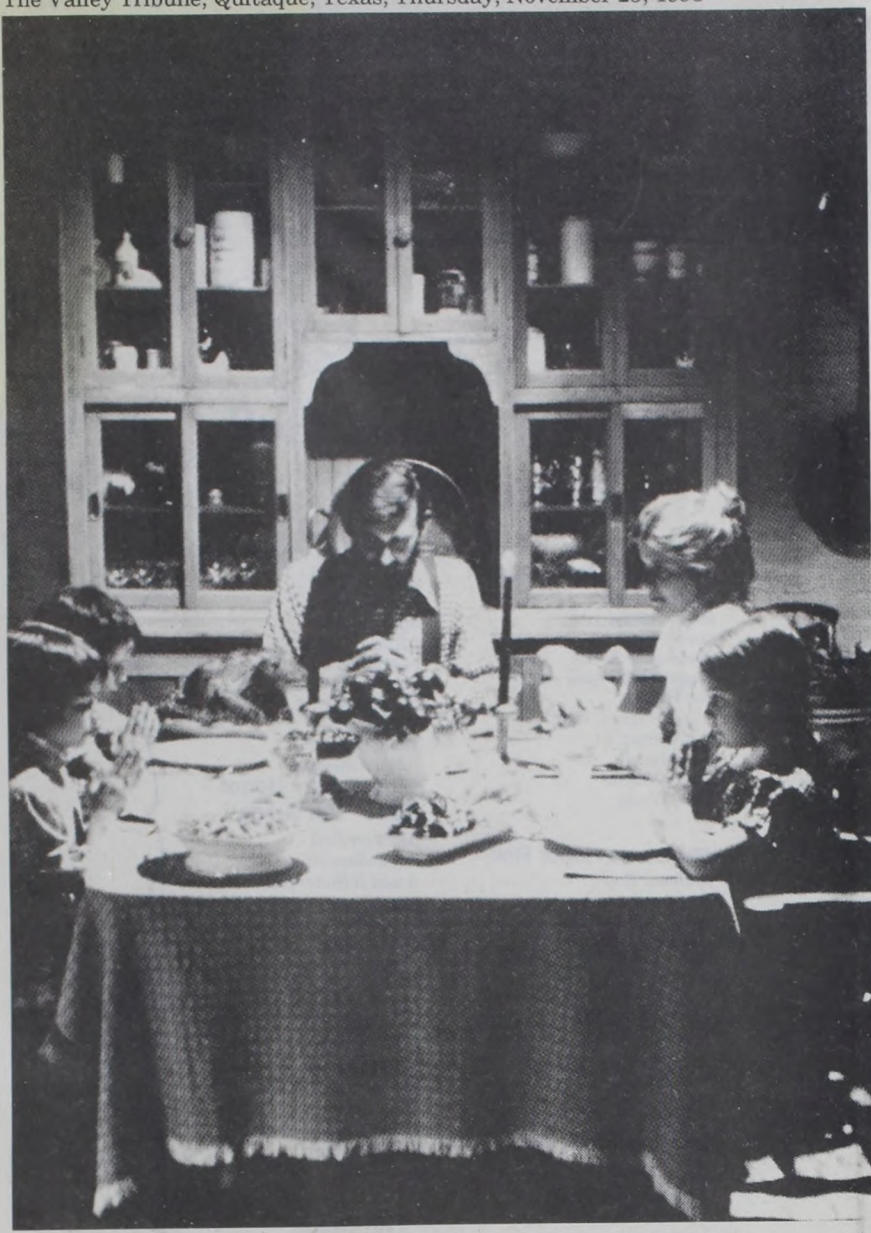
"We Thank Thee, O God . . ."