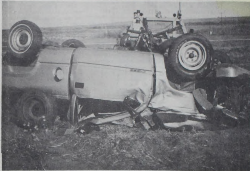
Three Valley High School teenagers were injured, two seriously, in this pickup last Friday, when it rolled over on the curve just west of Turkey. The vehicle, reportedly traveling at a high rate of speed, left the highway and rolled, hitting this highline pole in the process. The driver and one passenger were seriously injured, another was bruised and shaken, but returned to school that day.

Mission Cable provides quality cable television services to the community of Quitague. For more information on how to subscribe, please call 1-800-783-5771.