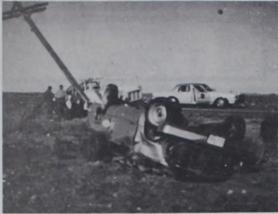
Hall County sheriff's department investigates the pickup accident which occurred Friday, while workers from the electric company examine the downed highline pole.