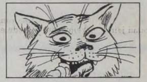
Cats do not have the ability to taste sweet things.