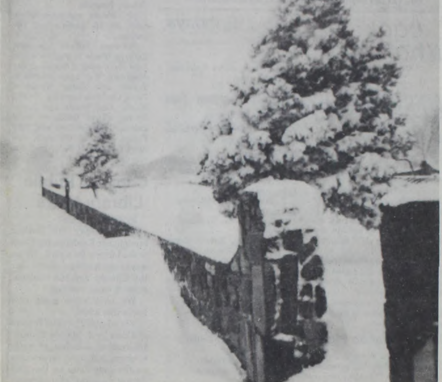
Snow, deep and wet, cloaks the park and playground in Quitaque Sunday afternnon. At this time, the big flakes were still falling. By night, the snow measured around 15 inches.

Admission is always free, door prizes are given away thorughout the show and there