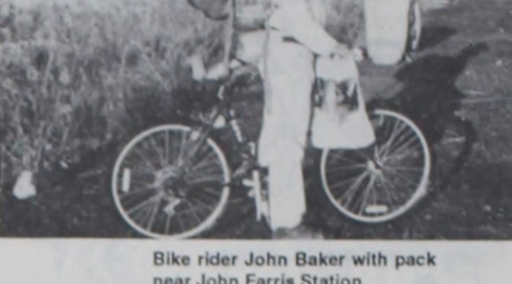
near John Farris Station

Reservations for the complimentary program are accepted from high school students and their parents. The informational event is designed to answer questions about various aspects of collegiate life. An audio-visual presentation will introduce TCU's 237-acre campus, some 350 full-time faculty members and a student body of about 7,000.