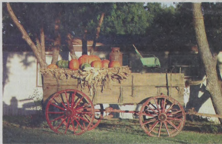
This wagon load of pumkins decorates the lawn of Don Stuckey in Roaring Springs

Floydada is referred to as "The Pumpkin Capital, USA." Although only 800 acres of the crop is grown annually in Floyd County, about a million pumpkins are produced. The people of Floydada feel that is something to celebrate.