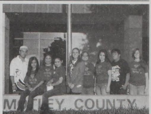
Valley FCCLA was host to 7 FCCLA chapters from across the area at a recent workshop in Matador.

Blunk's Studio photographers will be at Valley School on Tuesday, October 16. They will be taking individual student pictures in pre-kindergarten through eleventh grades during the morning. In the afternoon they will be taking junior high and high school football, cross country, cheerleaders and pep squad.