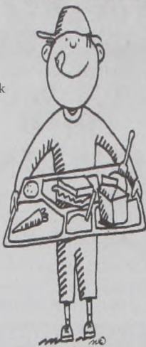
"Have a Great Week!" THE LUNCHROOM LADIES Menu Subject To Change

Lunch: Hamburger, Lettuce, Tomato, Pickles, Cheese, Chips, Orange Slices, Milk