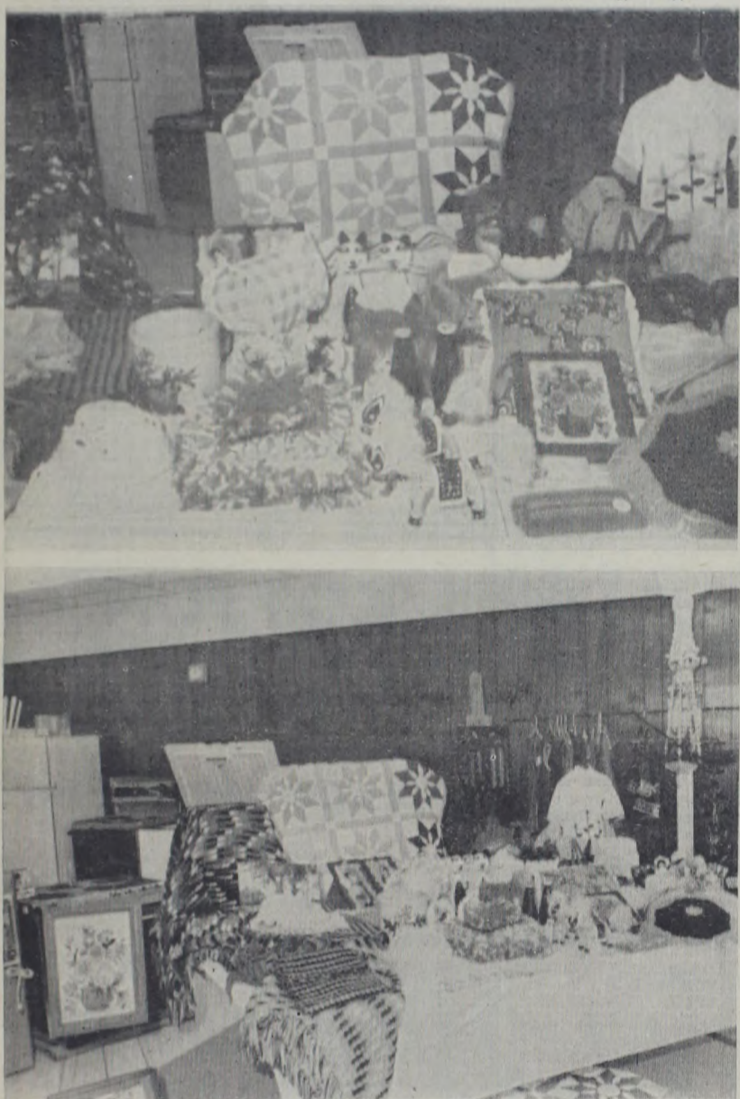
IN THE TOP PHOTO CAN BE SEEN TWO TABLES FULL OF "pretties" that will be on sale at the Quitaque Community Building Saturday, May 31. Articles that have been on exhibit at West Texas Utilities the past few weeks include a pair of beautiful handmade quilts, made by women here in Quitaque block by block; there are oil paintings painted by local artists; handmade place mats of several designs and colors, all different; articles of clothing that are real fancy; afghans, pillows, old-fashioned sunbonnets; animals made from a variety of material, such as a pair of horses made from new rope and they are fantastic, in Quitaque block by block; there are beautiful and decorative pillows; and so many beautiful and useful items that cannot be numerated in this space. The lower photo is a closer view of some of the things. They must be seen to be believed. Come early in Quitaque Saturday. Come early for the best selection.