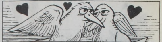
Valentine's Day was the day when, according to an ancient tradition, the birds chose their mates for the year.