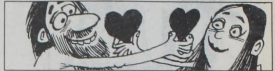
The custom of exchanging Valentines on Valentine's Day is said to have its origin in a pagan practice connected with the worship of Juno on or about this day.