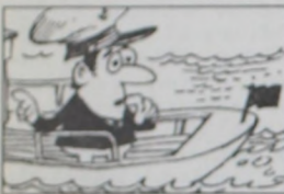
The next time you're on a ship remember: The fore is the front and the aft is the back.