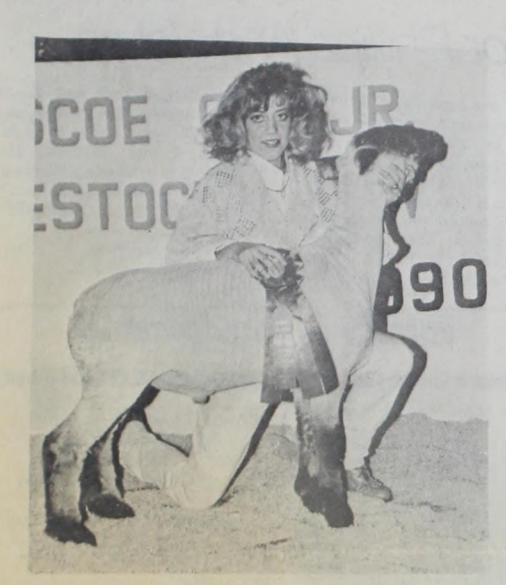
Breed Champion Finewool Crossbred Lamb, shown by April