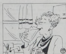
To avoid calcium deficiency, many people with lactose intolerance drink a special enzyme-treated milk.

That's -30- for this time, remember, what our country needs is a good five-cent anything!