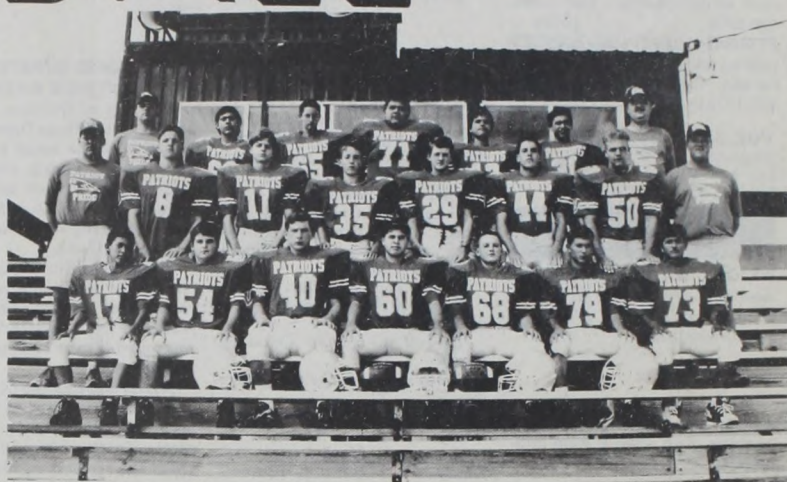
VALLEY PATRIOTS JUNIOR VARSITY