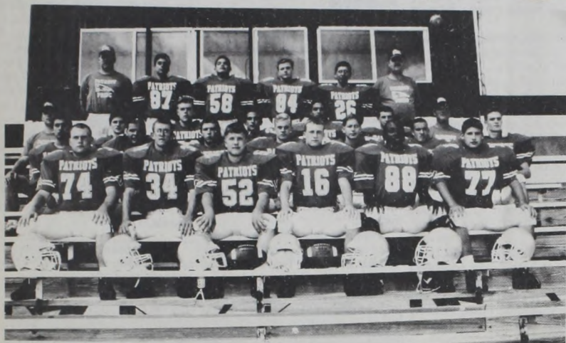
VALLEY PATRIOTS VARSITY TEAM