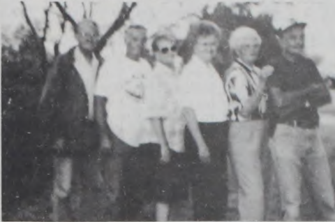
Children Of The Davis Family