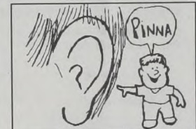
The outer ear, the folds of skin and cartilage that can be seen, is known as the pinna.

A dog can comfortably carry half its weight in a backpack. Working dogs can carry up to twice their body weight for short periods.