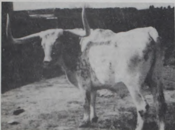
Longhorn steers which are on loan to the Caprock Canyons State Park from Fort Griffin arrived at the park Tuesday afternoon.