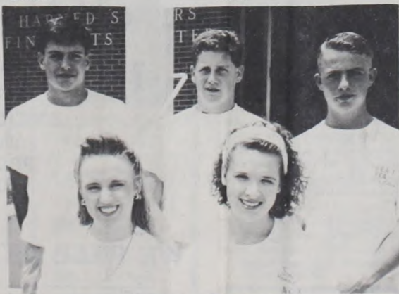
Valley FFA Members

The American Quarter Horse Heritage Center and Museum will be operating on the following schedule from May 1 through August 31: 9 a.m. to 6 p.m. daily. More than 15,000 visitors visited the museum in the first six months of operation last year and it is expected that the center will surpass this number in 1992.