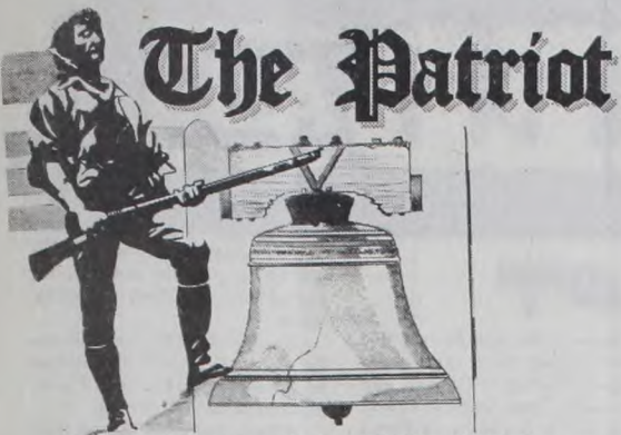
News From and about Valley School