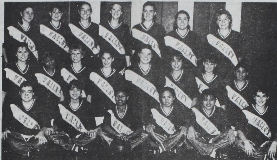
1996 LADY PATRIOTS