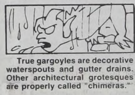
True gargoyles are decorative waterspouts and gutter drains. Other architectural grotesques are properly called "chimeras."