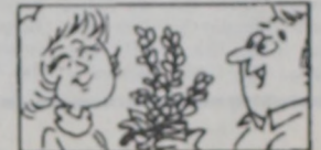
The state flower of Texas is the bluebonnet.