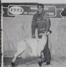
GRAND CHAMPION LAMB