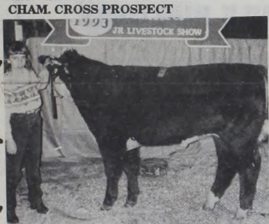
JAMIE PIGG WITH RESERVE BREED CHAMPION STEER