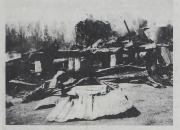
THE FORMER TEXACO WAREHOUSE EAST OF THE ELEVATOR IN TURKEY.