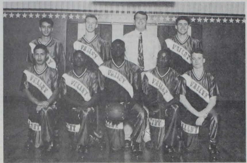
VALLEY PATRIOTS 1994-1995