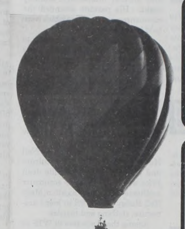
BALLOON RIDES FOR EVERYONE IS THE ORDER OF THE DAY SATURDAY.