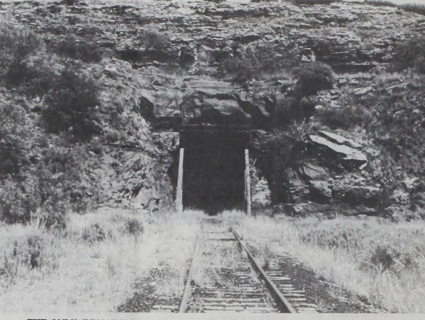
THE ONLY REMAINING TUNNEL IN THE STATE OF TEXAS, ON THE CAPROCK CANYONS TRAILWAY, IS ALSO THE LONGEST FORMER RAILROAD TUNNEL IN THE STATE.