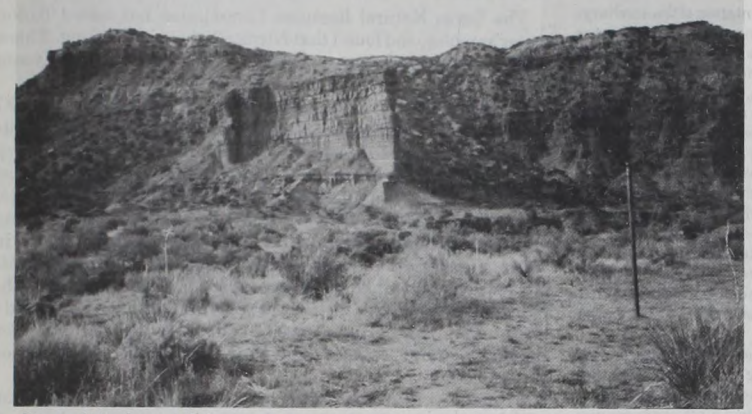
Part of the beautiful rugged country of Caprock Canyons Park. This was truly the End of the Trail for the Indians who first came to this country, with good water, plenty of hunting and game, and miles and miles of land protected from the cold winds of the panhandle.