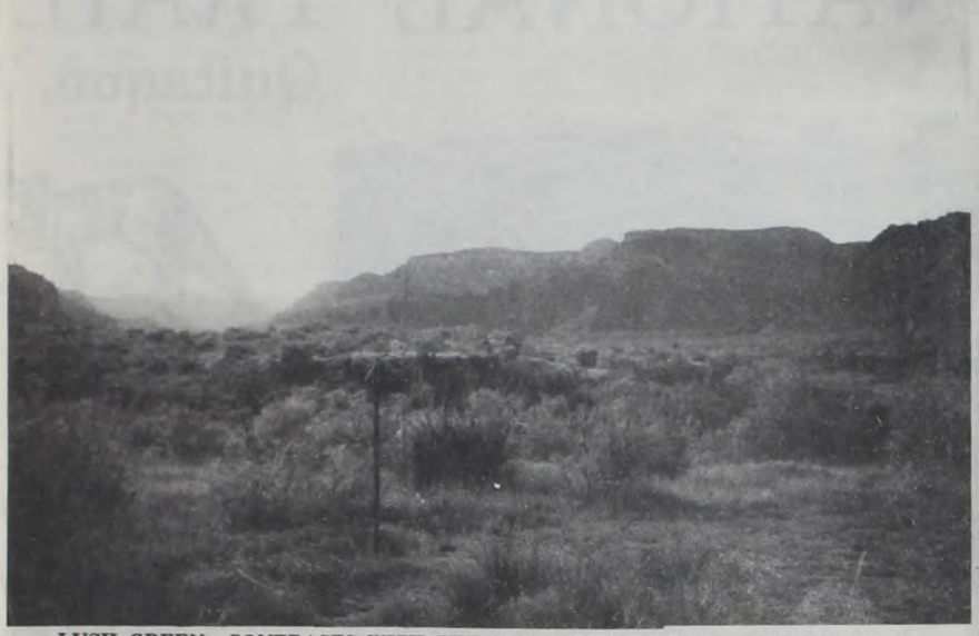
LUSH GREEN CONTRASTS WITH THE STARK RED BLUFFS OF CAPROCK CANYON. THIS IS TYPICAL OF SOME OF THE SCENERY TO BE SEEN ALONG THE TRAILWAY.