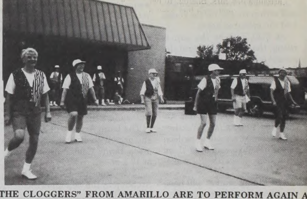
THE CLOGGERS" FROM AMARILLO ARE TO PERFORM AGAIN AT 5TH ANNUAL TRAIL DAYS SHOW ON SATURDAY.