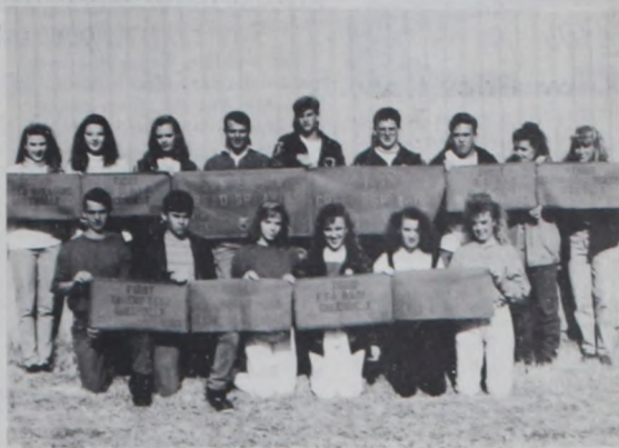
Valley FFA Leadership teams with District, Area, and State banners.