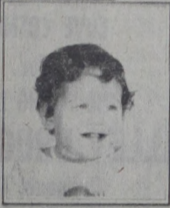
Compare at $25.00!

This very special offer is presented as an expression of our thanks for your patronage.