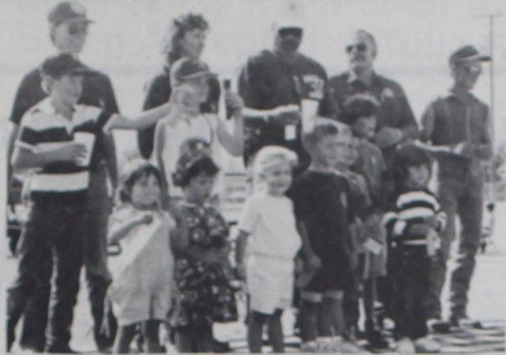
Winners of the tricycle races, balloon relay races, and style show --- Red Ribbon Week activities.