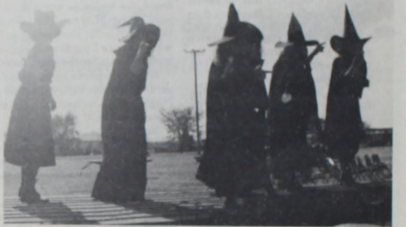
The "Witch's Crew" act closed the day's celebration last week.