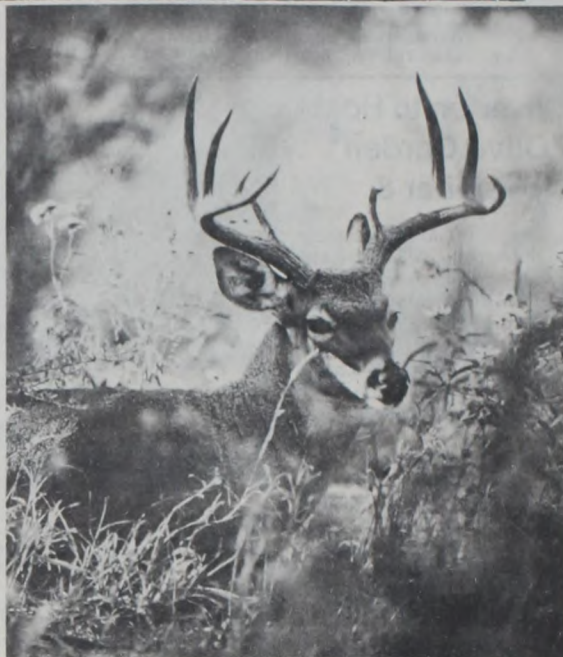
DEER OUTLOOK GOOD. Timely rainfall across most of Texas has helped deer herds. The archery season ends Nov. 1. General whitetail season is Nov. 7 - Jan. 3 for most of the state. General mule deer season is Nov. 21-Dec. 6 in the Panhandle.