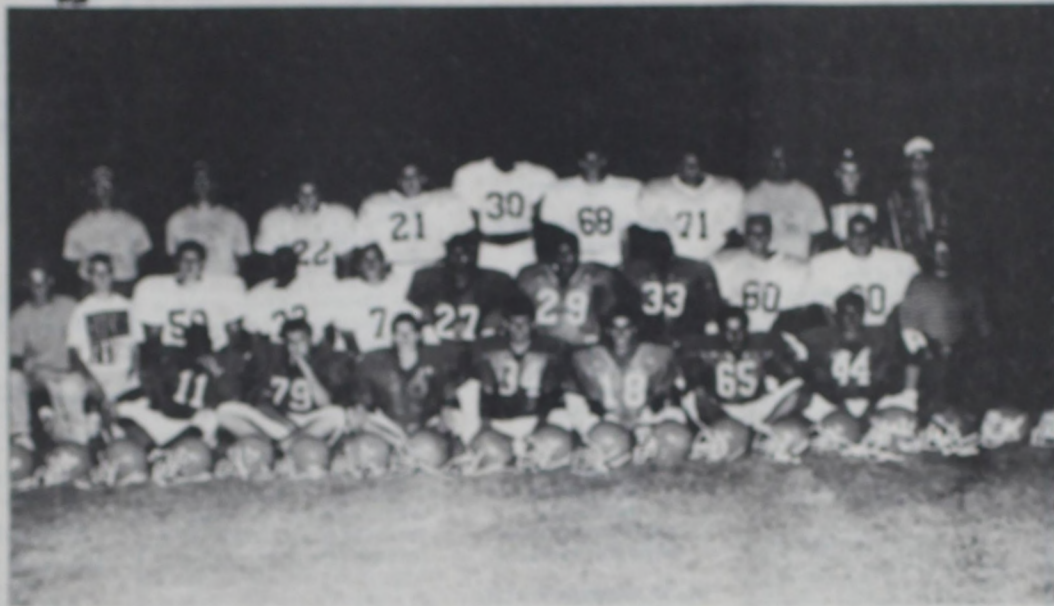
VALLEY PATRIOTS 1990 HIGH SCHOOL FOOTBALL TEAM