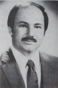
...I'll Keep Fighting To Claim Our Share.