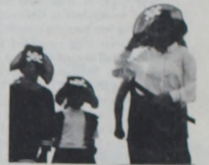
Members of the Pirate skit.