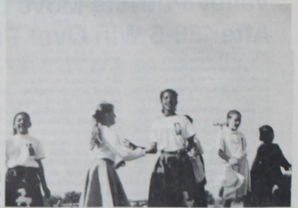
COME ON, LET'S TWIST AND SHOUT. Fifth grade girls were "twisting and shouting" to the music of the '50's.