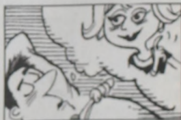
Researchers say everyone dreams. Some people just never remember dreaming.