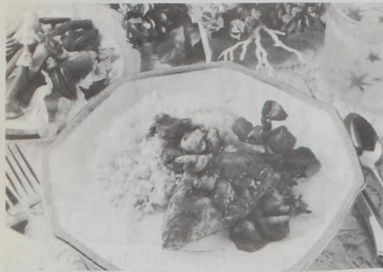
CHICKEN & MUSHROOMS A LA PROVENCALE