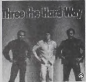
Three the Hard Way, starring Jim Brown, Fred Williamson and Jim Kelly, was one of the most popular Black films of the 1970s.

See how many of those flicks you remember with this quick trivia quiz: