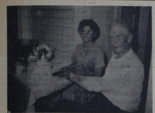
ATTEND GOLDEN WEDDING