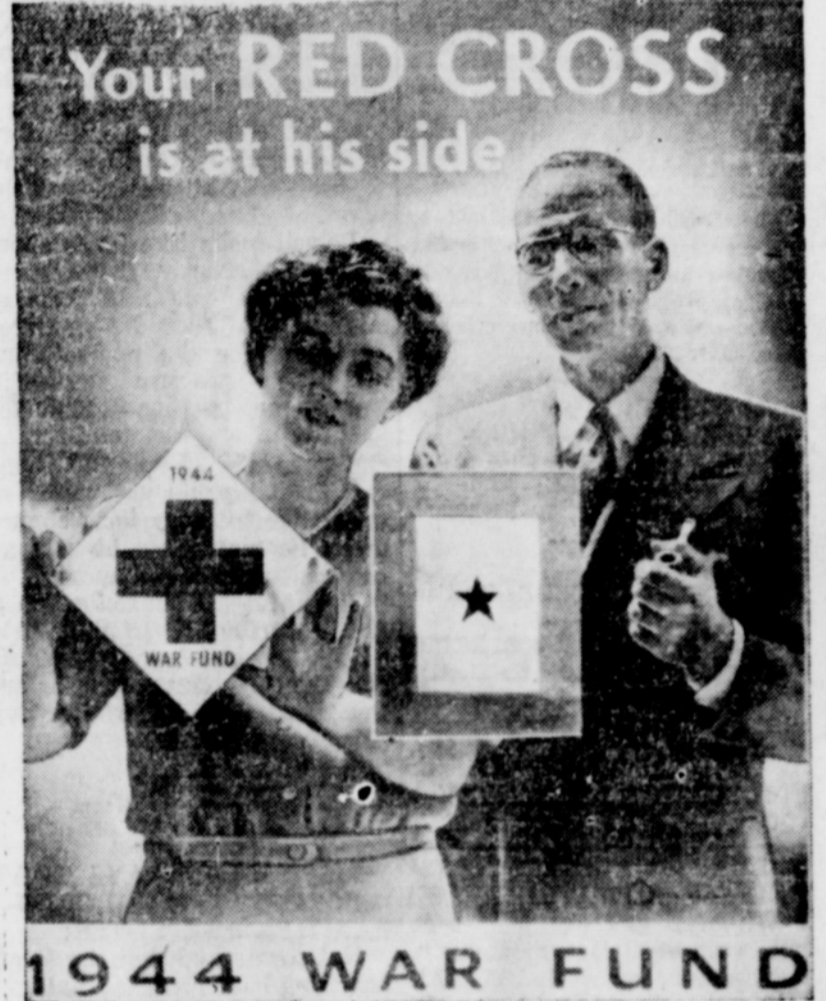
This year, with service flags in windows of nearly every home, Red Cross will mean so much more to Americans. As depicted in this reproduction of a 1944 Red Cross War Fund poster, many windows also will display the symbol of participation in the cause of Mercy and Humanity—the Red Cross.