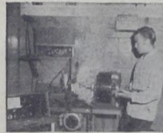
UL technician records measurements of ability of insulation system to withstand electrical stress after tool burn-out test under severe overload conditions.